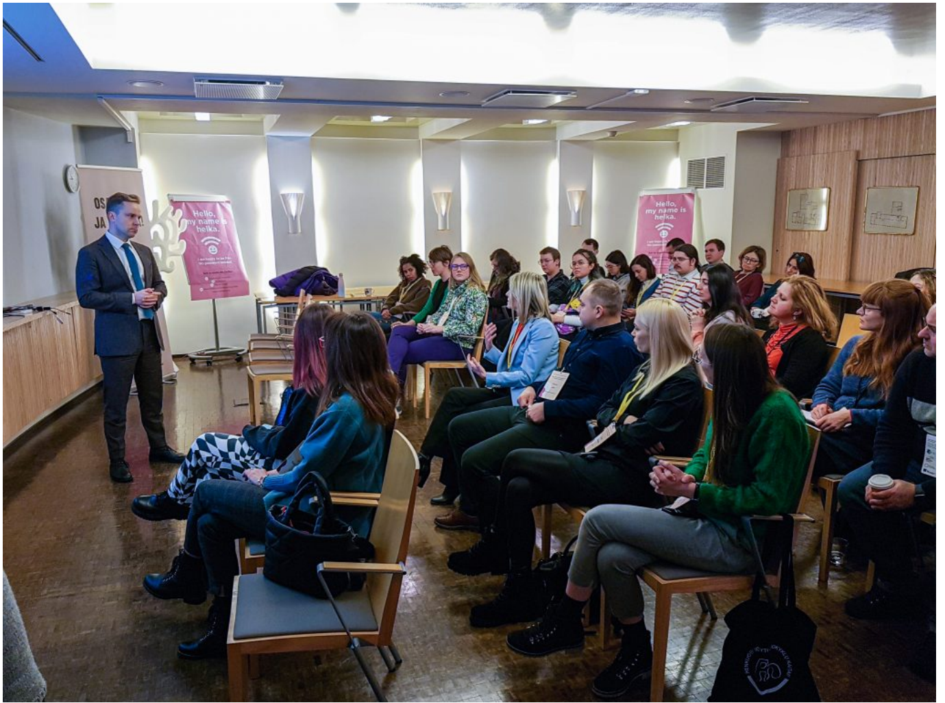
Petri Honkonen, the Finnish minister of Science and Culture, answers questions from participants