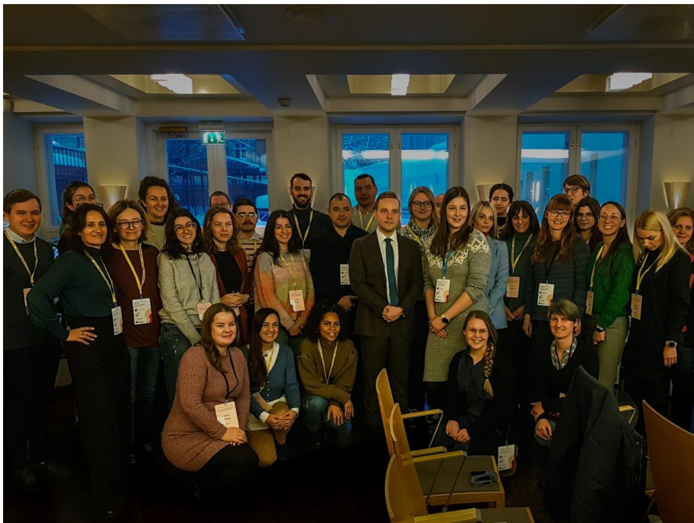
Group picture with Petri Honkonen, the Finnish minister of Science and Culture