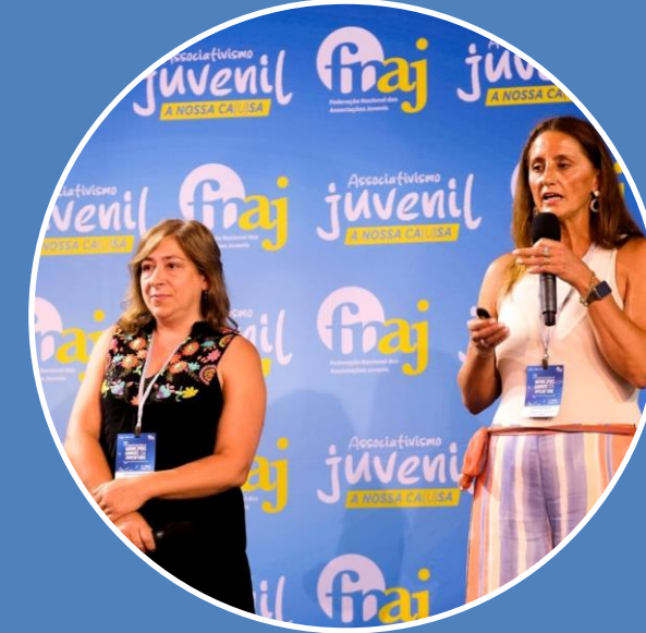
“New Voice to Youth(s)2.0 Presentation as an exemple – IV Nacional Encounter of Youth Friendly Municipalities, Loures, PT