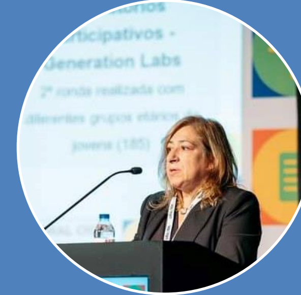
Presentation of “New Voice to Youth(s)”as an example“ Involving Young People in Public Policy – 23th ODP Conference 19.10.24, Valongo: https://oidp2024.cm-valongo.pt/wp-content/uploads/2024/10/vista-geral-OIDP-17-out.pdf