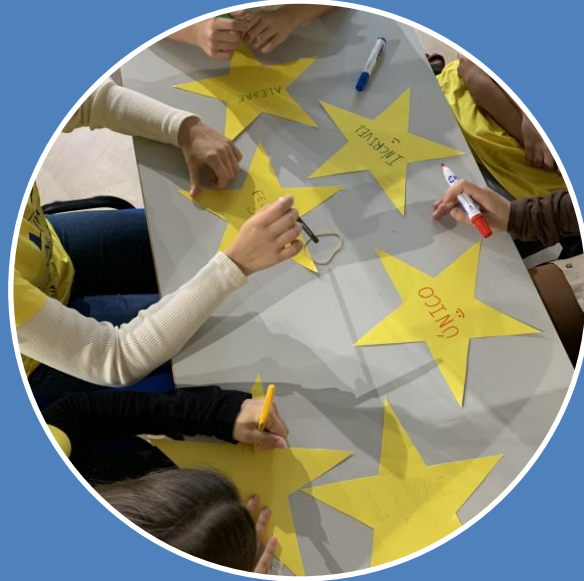
Videos and fotos