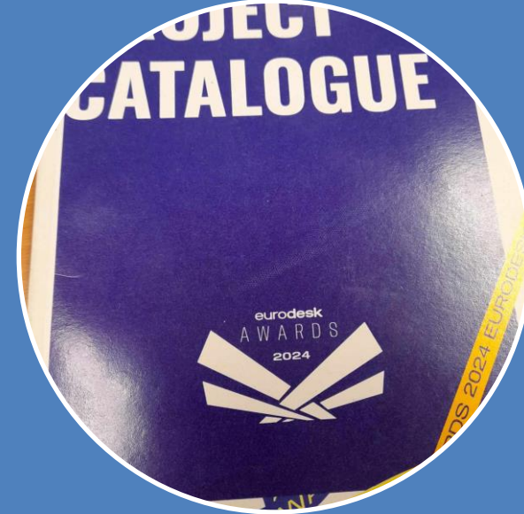
Presentation of Power-Up Group- Eurodesk Awards pág. 116 e 177: project catalogue 2024web 2024-05-30 11 41 29.pdf